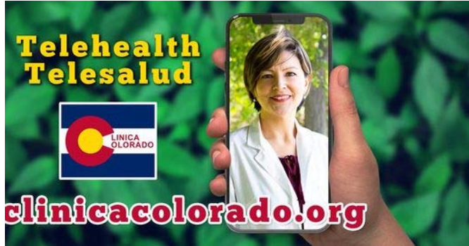
Pivoting to Telehealth in 2020